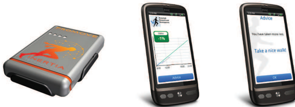
Figure 1. The Activity Monitoring and Feedback system from Roessingh Research and Development. Depicted is the ProMove-3D activity sensor, and two screenshots of the Smartphone interface showing a graph of daily activity and a motivational message.

These motivational text messages, which will be the focus of the rest of this article, are currently used in a relatively ad hoc manner. The Smartphone can be set to generate a motivational message every hour (or every x minutes), and at that time, the message to be presented to the user is picked randomly from a pre-defined list of