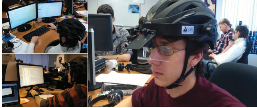
Figure 1. Field experiment.

Analysis. Analysis of the results was performed using a programming language for statistical data processing and graphics – “R”. So, were constructed an IBS distribution histogram for each of the participants (see Figure 2). Visual assessment of the distribution histogram shows a strong deviation from Gaussian shape distribution (distribution of IBS is seems not to be normal). We use the Shapiro-Wilk test with params p-value > 0.05 and indicate that all samples are different from normal. The next step was to compare all samples. We use non-parametric Kruskal-Wallis test. As a result of Kruskal-Wallis test is the fact that our distributions are significantly different (p-value = 6.14e-32). There is a diagram with 10 distributions in Figure 3.